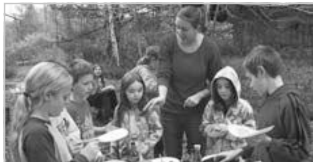
Danby youth prepare ingredients for a stir fry to be cooked over a campfire during the after-school program Campfire Cooking . During five weekly after-school meetings, the group of eleven built cooking fires and then practiced techniques for cooking with a dutch oven and roasting food on a fire. Pizza-from-scratch and chocolate cake are two examples of the delicious meals this group of Danby youth cooked and then devoured!