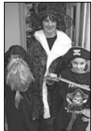
Fanciful and Imaginative Creatures filled the Danby Town Hall during the Community Council's 2009 Halloween Party.