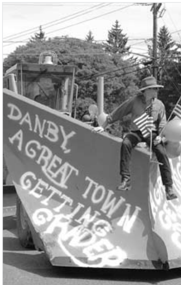
In the parade, Danby, a great town getting "grader".