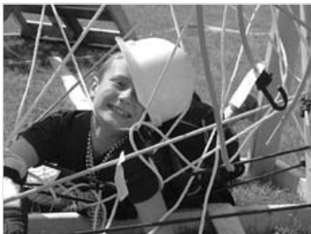
Fun Day fun, learning fire safety

Any questions? Contact the American Legion Post 221, 607.272.1129 ☘