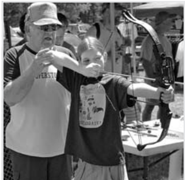
Learn to use a bow and arrow at the Flashing Feathers booth during Fun Day!

Certificates will be available for pickup at the Danby Fun Day. Thereafter they will be sent to recipients. Names of all recipients will be posted at Fun Day and at the Town Hall. They will also be published in the Broader View Weekly and in the August Edition of the Danby News. Thanks to all who participated by nominating our volunteers and thanks to the Town for their support. Next year we will form a committee and hopefully keep this going for many years to come! ❁