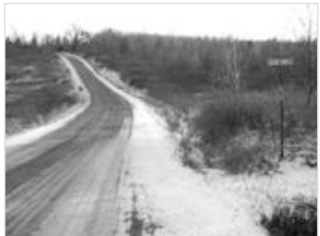
On an uphill rural road, we find the sense of rural openness that makes Danby a unique location and the home of so many wonderful people living life in the Slow Lane.

Other meetings will be scheduled if this date doesn't work out for you. ❀