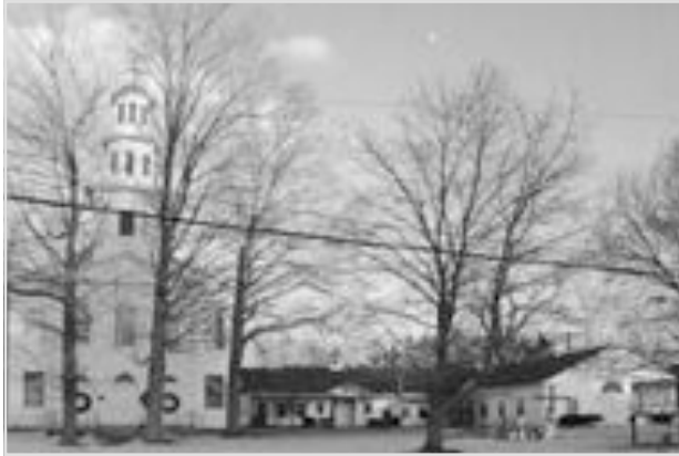
The Danby Federated Church, all dressed up for the season.