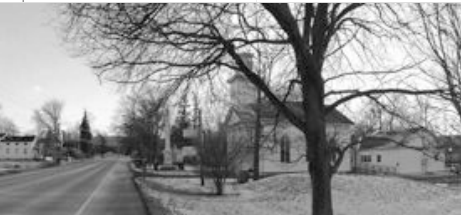
The Danby "uphill" Hamlet, one wintry afternoon. The Danby Community Park is on the left, Town Hall is on the right, and the Federated Church is in the distance. The ubiquitous NYS Rt.96B...is hard to miss.

Residents in the area of East Miller Road presented the Board with a petition and about 40 signatures, asking that action be taken to deal with a derelict house at 704 East Miller. Its owner is a Florida resident, and the house is on the market. The property has been posted as condemned and the owner served with an order to remedy its condition by February 16. Failure to address the problems could result in further action by the Town, leading up to demolition at the owner's expense. ❁