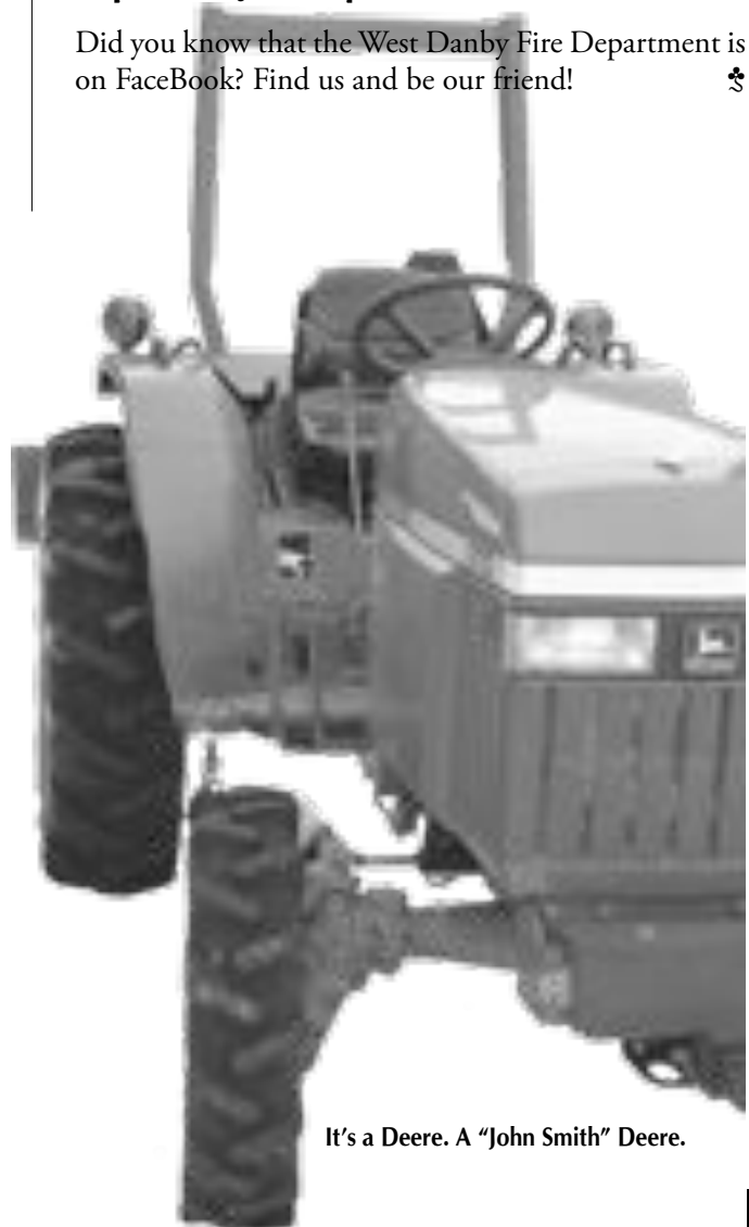
It's a Deere. A "John Smith" Deere.

Did you know that the West Danby Fire Department is on FaceBook? Find us and be our friend! ❁