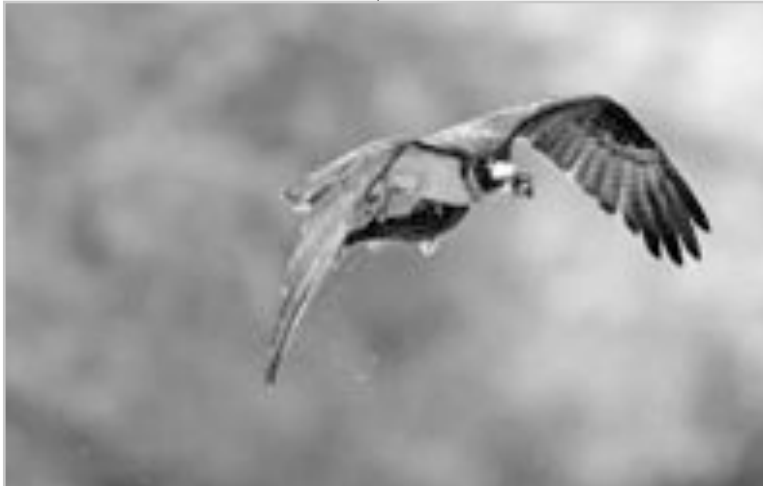
An early morning photo outing brought home this image of an Osprey, just after catching a wide-mouth bass at Jennings Pond.

Please contact me at jnk54@cornell.edu or 607.272.2292 x222. ♣