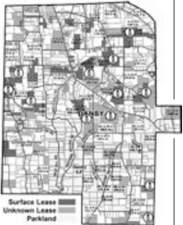
Figure 3: Potential gas well locations in Danby. Illustration based solely on the estimated concentration of leased land.

Base map courtesy Marcellus Accountability Project.