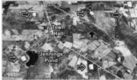
Figure 2: Danby Central Hamlet with hypothetical well pads at 640-acre (1 mile) spacing.

There are a variety of educational resources available online to learn about shale gas drilling and its impacts. A link to the entire MWG presentation is on Danby’s web site, [town.danby.ny.us/GasDrill1].