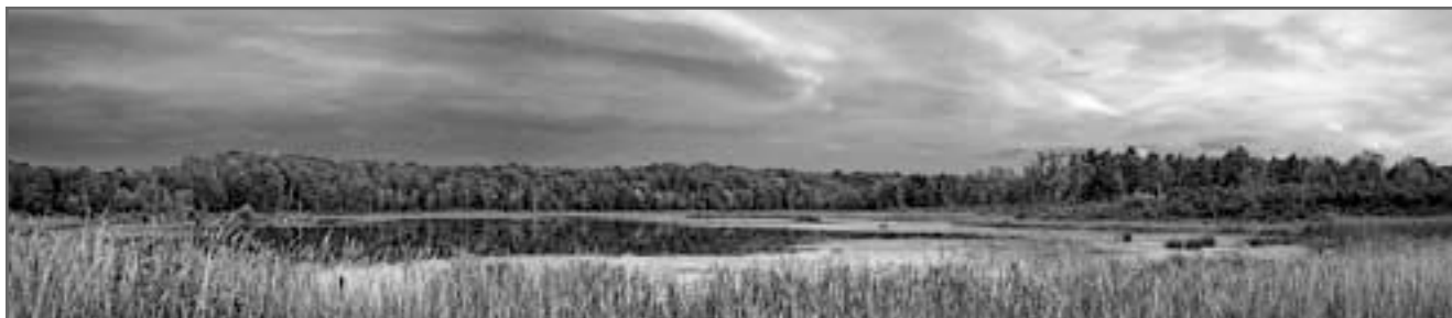
Jennings Pond Sunset

I’ll try and not resent our winged amigos when I am scraping a frozen windshield on a cold, dark winter morning in Danby...while they are waking up in a palm tree on the beach in Costa Rica. I’ll try. ♣