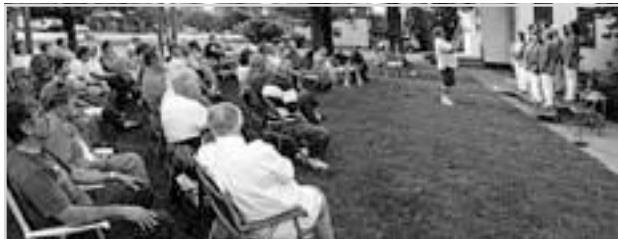
The Cayuga Chimes and Ice Cream made for a big crowd at the DFC event, “Sundae on Wednesday”.

Please contact me with your observations at [jnk54@cornell.edu] or 607.272.2292 x222. ☘