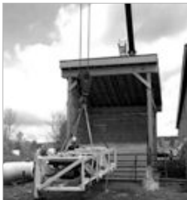
The feed mechanism of the new wood boiler was carefully lowered into place at the Highway Barn.

As always, if there is an issue the Town should address, please contact me, [ supervisor@town.danby.ny.us ]. ☘