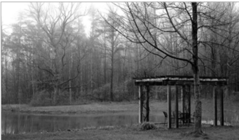
Danby's hills and hidden hollows are full of breathtaking natural beauty. This pond and pergola were outside one of the Green Homes Tour dwellings.

In the area of Bioenergy Education, TC3 organized a bioenergy conference this past April, in the interest of establishing a future curriculum. Cornell's Boyce Thompson Institute for Plant Research is hosting a Bioenergy and Bioproducts Education Teacher Training Program in July, and SUNY/Cobleskill has a new Center for Environmental Science and Technology. ❁