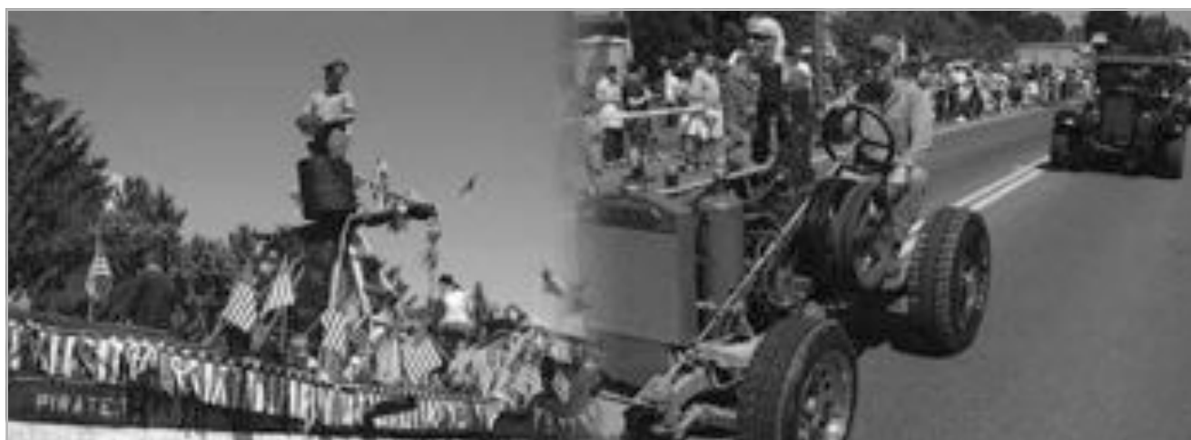
Danby Fun Day is sailing/steaming/driving ... coming our way on July 14!

Come spend time with other Danby girls, have a spa and yoga day, hike on a Finger Lakes Trail to a Lean To, and of course teach each other fun games and cook foods to share!