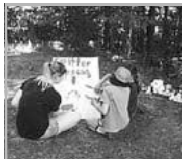
Making "Critter Crossing" signs for Bald Hill Road

As always, these programs are funded by the Danby Community Council, and free to Danby residents. Registration is required. ♻️