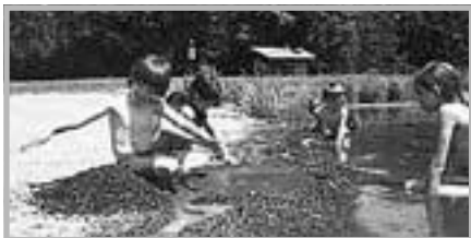
Exploring Jennings Pond, thank you Life Guards!

We had a great summer, exploring Jennings Pond and the Danby Town Park, painting signs, helping at the Danby Fun Day, playing games, and exploring different parts of Cayuga Lake by boat and van.