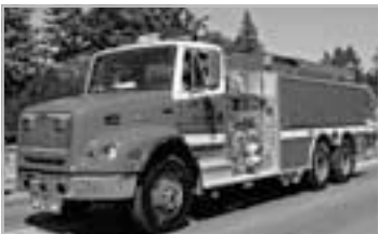
Meet all the Fire Trucks during Danby Fun Day!

Feel free to attend our next DCC meeting. All Danby residents are members. We usually meet on the first Thursday of the month, at 7pm in the Danby Town Hall...but in July we observe the 4th of July and will meet on July 11. ❀