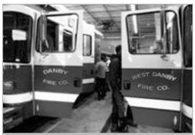
Members of both Danby fire departments have been putting in many extra hours of training, taking the new trucks out almost every day for driver training, and spent two weekend days at Jennings Pond being trained by the manufacturers representative on the operation of the new pumps.