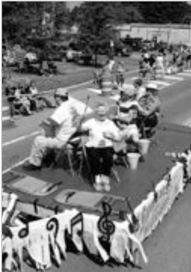
DFC Float in the Fun Day Parade

Questions? Contact me at [ danbydan@hotmail.com ] or 607.272.7582. ❁