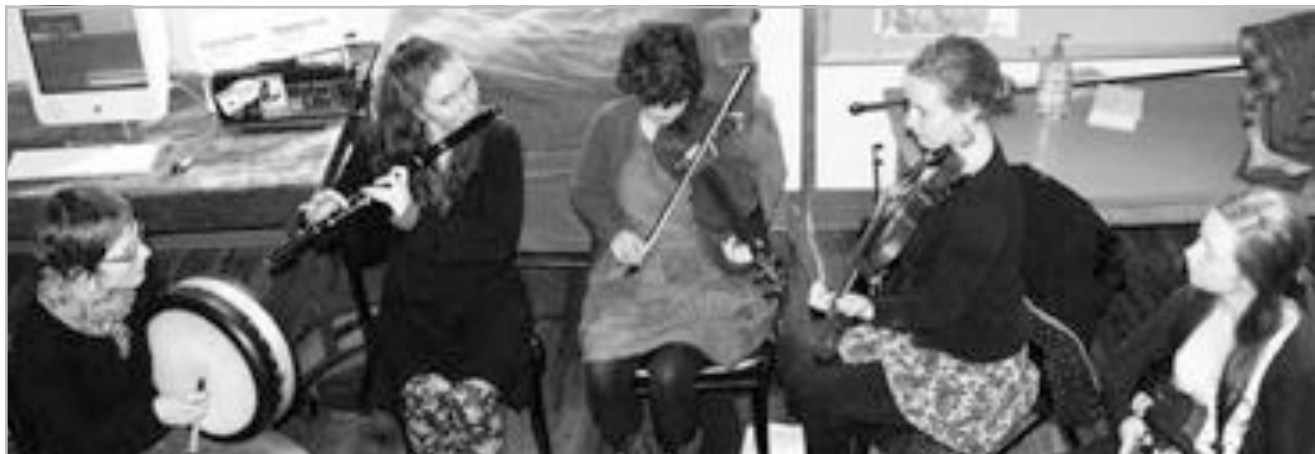
The Grady Girls coming to Town Hall on Sunday, March 15, 3pm

Save the date! Danby Fun Day 2015 will be Saturday, July 11, 2015. ❀