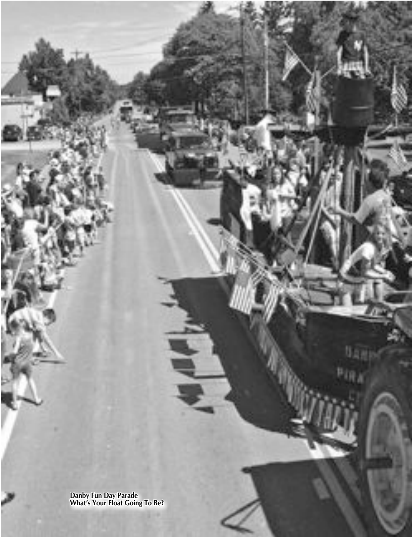
Danby Fun Day Parade What's Your Float Going To Be?