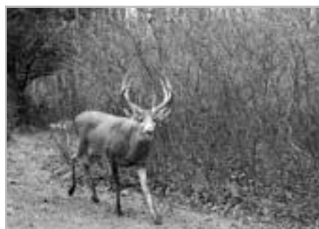
Out for a stroll

This morning though was spent watching my neighbors—the animals, not the Danby residents. I was entertained by a pileated woodpecker who was working out the pecking order at the bird feeder with a large gray squirrel. I enjoyed the walks over to the apple trees by various tribes of deer. I saw the panic that the does get into when they smell a buck approaching...and run away. And I must say we have some very impressive specimens of buck out here.