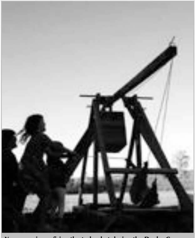
Young engineer firing the trebuchet during the Danby Community Council's Harvest Fest in October 2015.

The next "Truck" (it's always the 4<sup>th</sup> Monday of the month) will be Monday, January 25 at Noon. It will be held at the Danby Fire Station for the months of January, February, and March. We will resume meeting at the Danby Church in April.