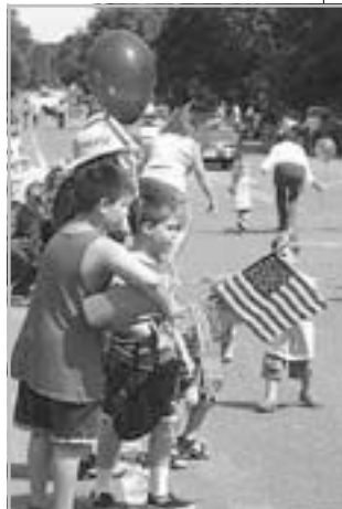
Danby Fun Day 2007

For more information, you can find us at [whitehawkecovillage.org] and click on Gatherings . ❁