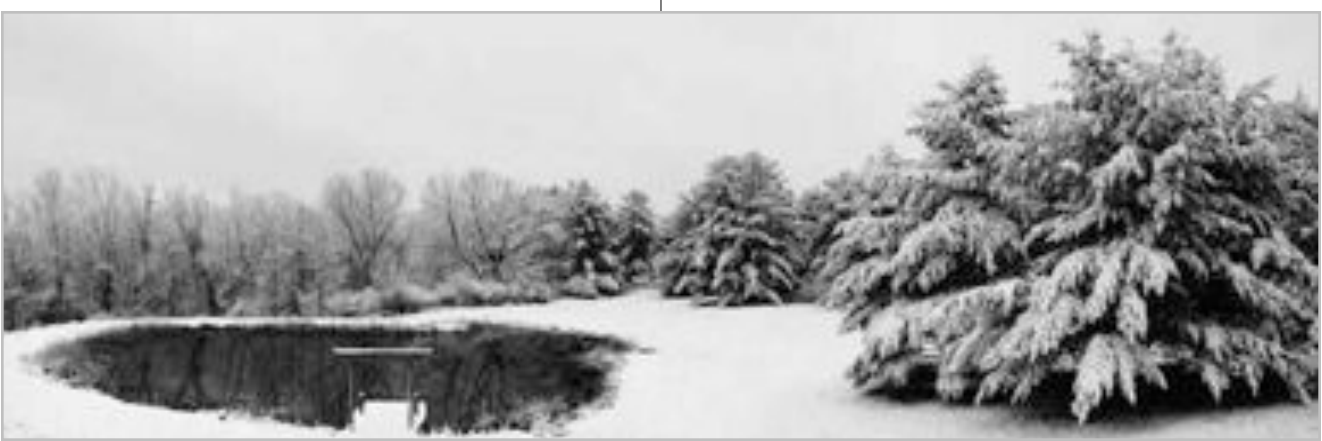
First light on first snowstorm.

There is an indoor Danby Food Pantry at the Church, for Danby residents, on December 20 (always the 3rd Thursday, 3-6 pm).