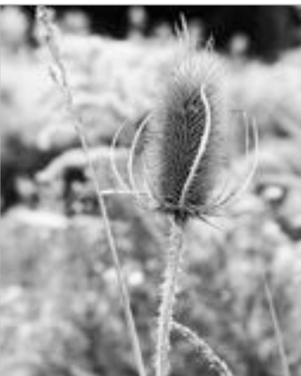
Teasel.

You can always reach us by phone, 607.277.4788 and by Email at [townclerk@townofdanbyny.org].