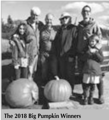
The 2018 Big Pumpkin Winners

Weight in pounds and girth in inches will be used to determine the champion. The weigh-in will happen during the Danby