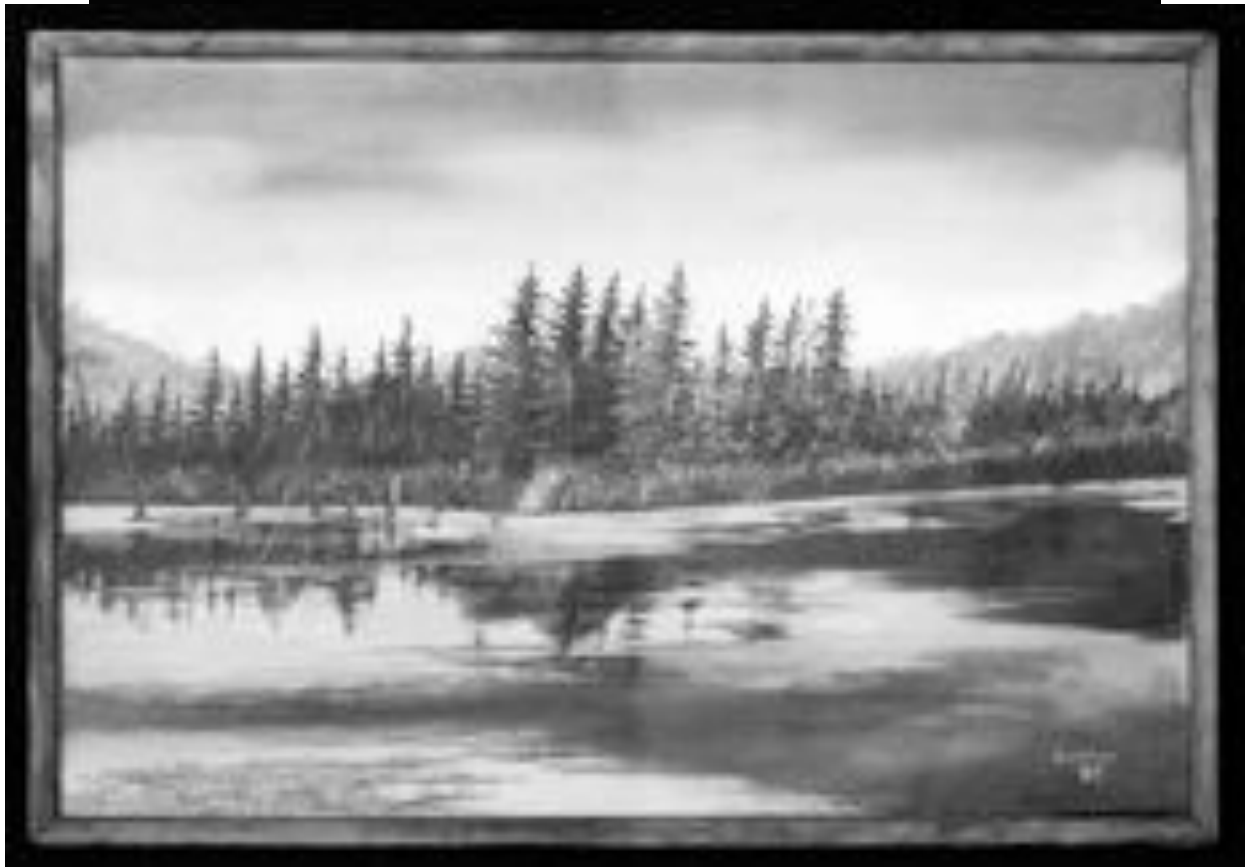
Danby Art in Danby's Town Hall