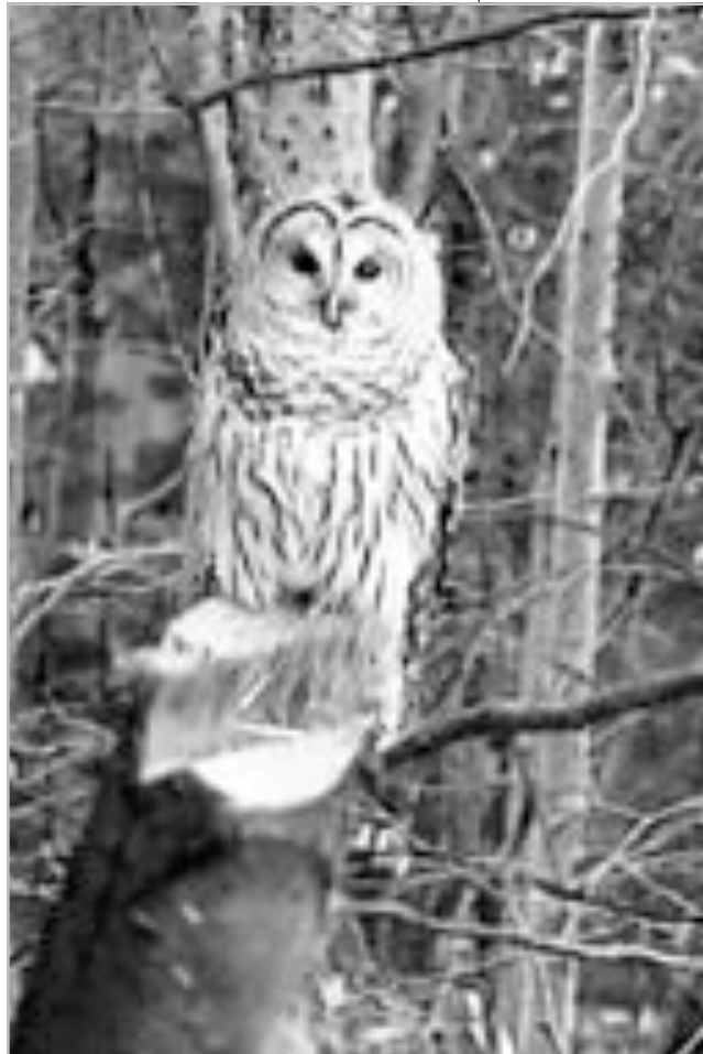
Juvenile Barred Owl

The count day ended with a potluck dinner and compilation of data collected during the day at the Cornell Laboratory of Ornithology. Thanks to all of the Danby count participants. I hope you will be able to join us again next year for the 59 th annual Ithaca area Christmas Bird Count. ❀