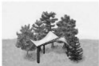
Arch and Esther Dotson Park

S OME EXCITING THINGS ARE HAPPENING in Danby's backyard! You can get the full scoop during the Danby Community Park Association annual meeting on Wednesday, September 8, 7pm.