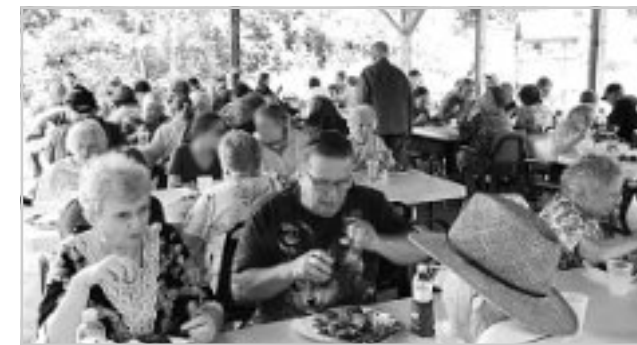
Danby Seniors BBQ at the ALP

Save the date: Thursday December 2 for our holiday luncheon at LaTourelle. ❄️