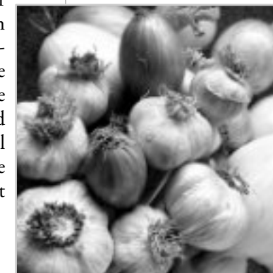
Allium: Onion, Garlic, Shallot

As the year moves on, we considered the fact that several members's terms will be ending in January. While we hope many current members will agree to continue on, we are always looking for new members, especially those with an interest in actively promoting the conservation easement program.