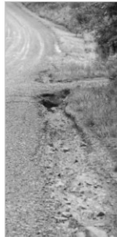
Storm water damage (before repair): Gully carved out of road, road washed into field —Southern Comfort Road

S EVERAL WEEKS AGO, members of Danby's Highway Department showed up in its trucks on East Miller Road to repair damage to the road. The shoulder was carved out due to the severe rains this summer. As a consequence, when it rained intensely, water ran through our stable creating drainage and management challenges.