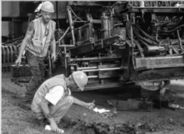
The size of the machines is amazing; three such trucks heat, melt, and break up the existing asphalt. The huge flat burners underneath the trailer body are propane heaters, using 100s of gallons a day, and then stiff forks scrape the road to loosen it. Of course, all this requires continuous maintenance. Would you climb under there?