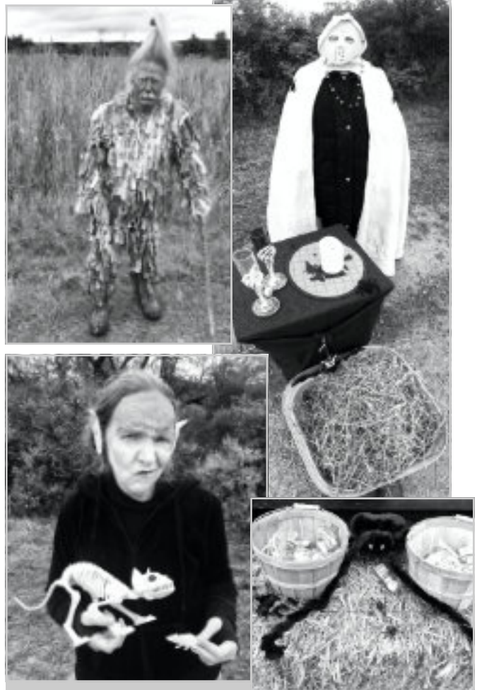
Alien creatures at Danby's Halloween Trunk or Treat Event

Links to all the YouTube videos can be found at [ danbycc.org ] (click on "Past Events"). You'll find virtual flower walks, hi-tech programs from outer space, guitar and harp concerts, and even some cooking presentations. ❀