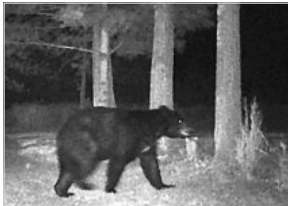
The Danby Bear out for a midnight stroll near Steam Mill Road

For more information, visit [ twintiershonorflight.org ] or call 607.339.9269.