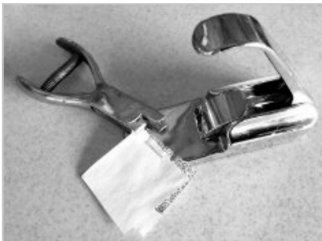
Paper welder, model D or E, welded papers, and needle sort punch.

Time to sort for temperature? Stack all the cards together and insert a needle through the appropriate hole.