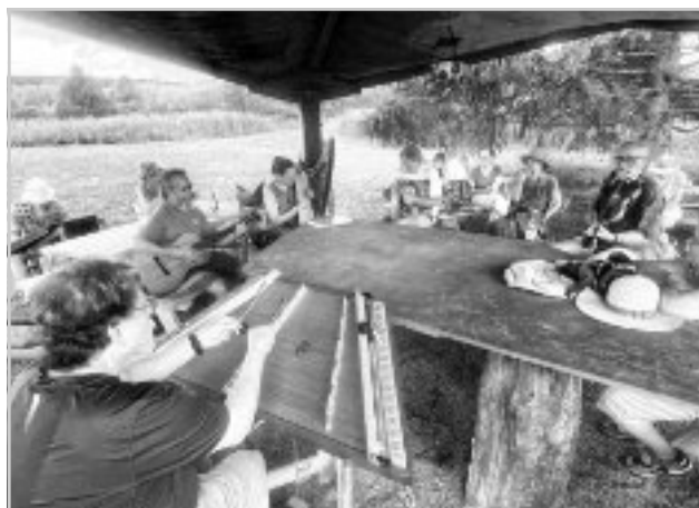
The All-Styles Music Jam in Dotson Park, August 2022