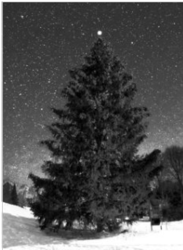
Dotson Park in wintertime. Sirius, a star, seems to glow atop the Spruce tree.