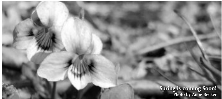
Spring is coming Soon!

...plus all those who have sent subscription-level donations