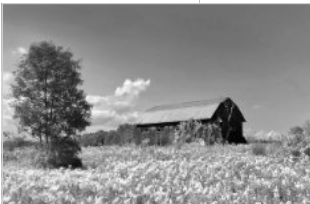
Jersey Hill Road Barn

Here's a reminder that daylight saving time ends for the year on Sunday, November 2, when clocks fall back one hour. That's also a good time to check the batteries in your smoke alarms.