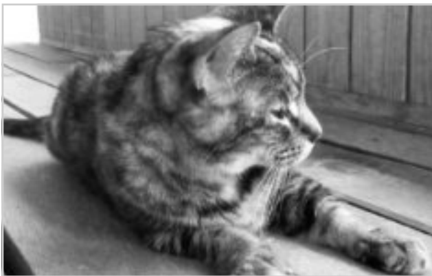
Sunrise's last day in the sun.